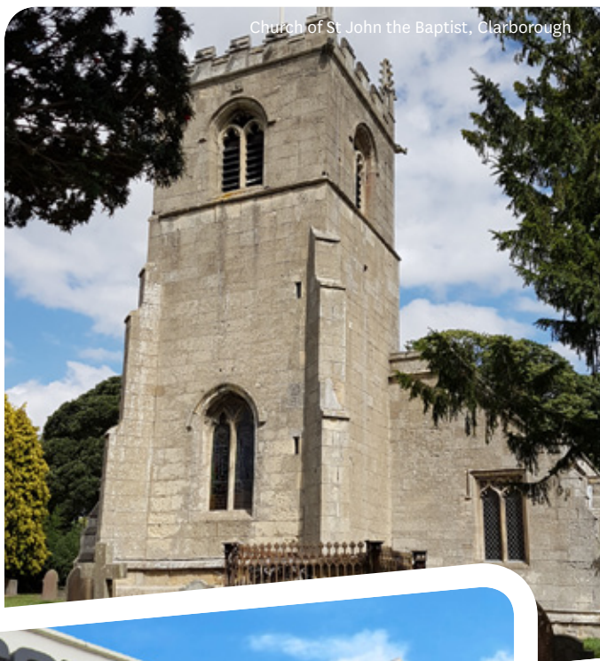
Church of St John the Baptist, Clarborough