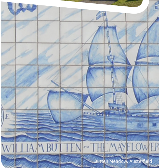
Butten Meadow, Austerfield

A few hundred yards further along, and opposite the Austerfield Field Study Centre (a 70 acre environmental education centre and community hub), is Austerfield Manor House , reputedly where William Bradford grew up. Although the Manor house is a private residence, it can easily be viewed from the road.