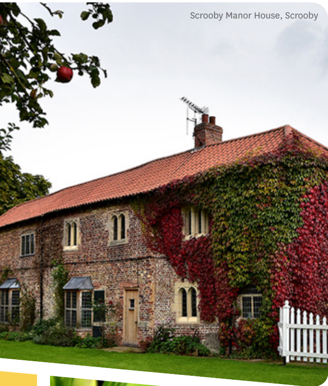
Scrooby Manor House, Scrooby

Near to the north gate leading into the churchyard, is the village pinfold , now planted up as a very pleasant communal garden and is a quiet spot to sit for a moment to consider the Separatist's plight. Beside the pinfold is the timber-framed Old Rectory , now a private home, and a building that our Scrooby Pilgrims would have known well.