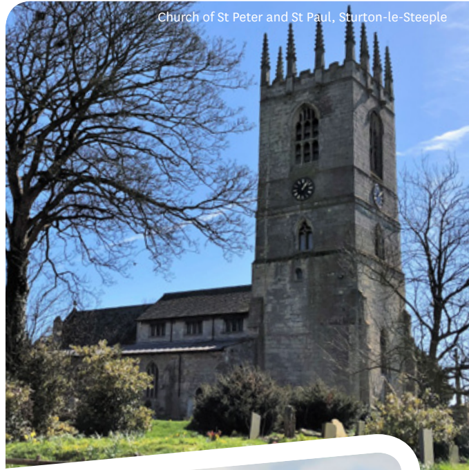
Church of St Peter and St Paul, Sturton-le-Steeple

Opposite the church, The Reindeer Inn is a great pub to enjoy a refreshing break for lunch or dinner and a pint!