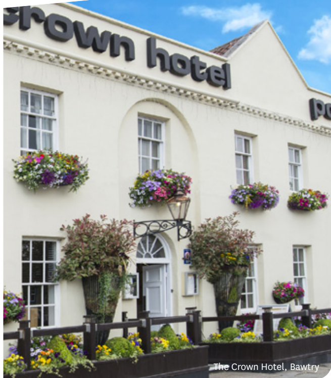
The Crown Hotel, Bawtry

Beside the entrance to Bawtry Hall , in Tickhill Road stands Bawtry Masonic Lodge containing the remnants of the ancient Hospital Chapel of St Mary Magdalene, where many members of the Catholic Morton family were buried. Pilgrim William Brewster's brother, James, was once Master of the Hospital Chapel which remained in use until being partly demolished and incorporated into the existing 1839 building. Situated at Bawtry's heart is the 4 star former posting house, The Crown Hotel , a wonderful place to stay to explore the Pilgrim Heartland Trail.