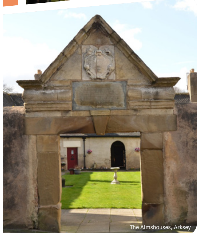
The Almshouses, Arksey