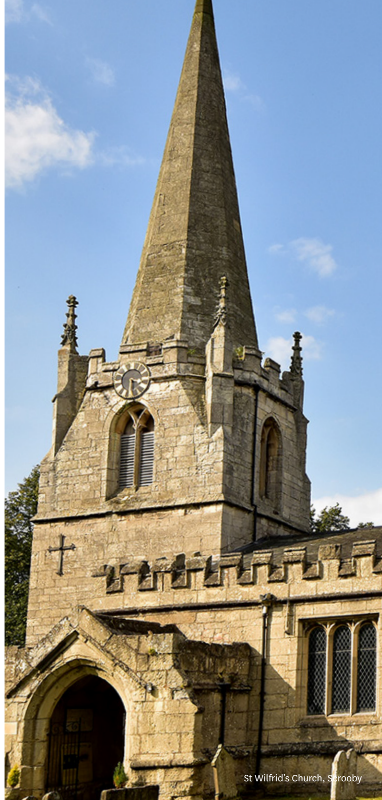
St Wilfrid's Church, Scrooby

When Separatist preacher, Richard Clifton, was deprived of his living at Babworth, Scrooby Manor became the meeting place for those who desired to worship according to the dictates of their own conscience. Brewster, who had long been attracted by Separatism, along with fellow Separatist Richard Jackson, was fined for non-attendance at Scrooby's parish church. Shortly before the Scrooby congregation's flight to Holland, arrest warrants for 'Brownists' William Brewster and Richard Jackson were issued but these birds had already flown.