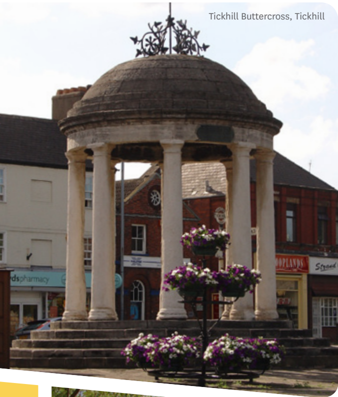
Tickhill Buttercross, Tickhill