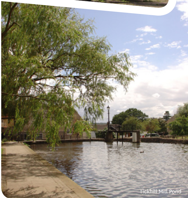
Tickhill Mill Pond

No visit to Tickhill is complete without a quiet stroll along Lindrick Road (which starts beside The Mill pub ) towards the old water mill and to take in the view towards St Mary's across the duck-filled Mill Dam , the perfect place to stop for a picnic.