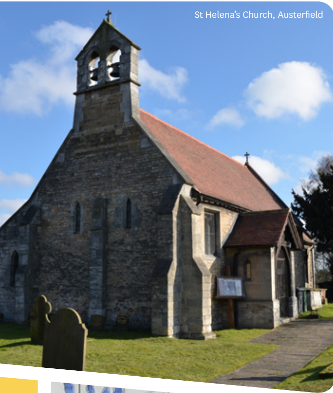
St Helena's Church, Austerfield