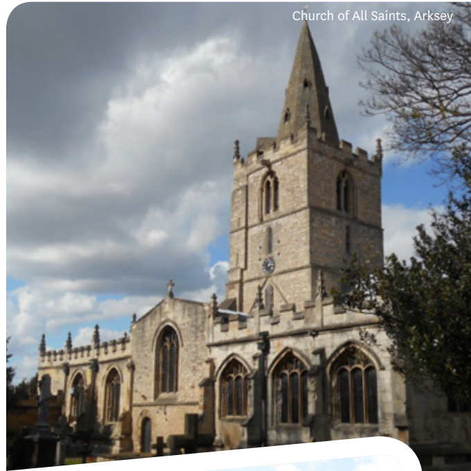
Church of All Saints, Arksey

Close by the Old School Tearooms is the perfect place to drop in for a nice cuppa!