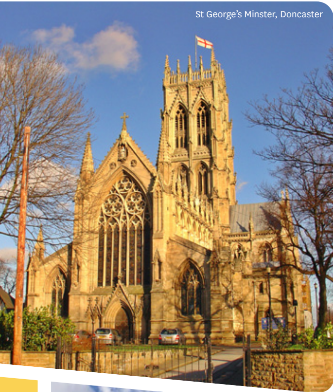
St George's Minster, Doncaster