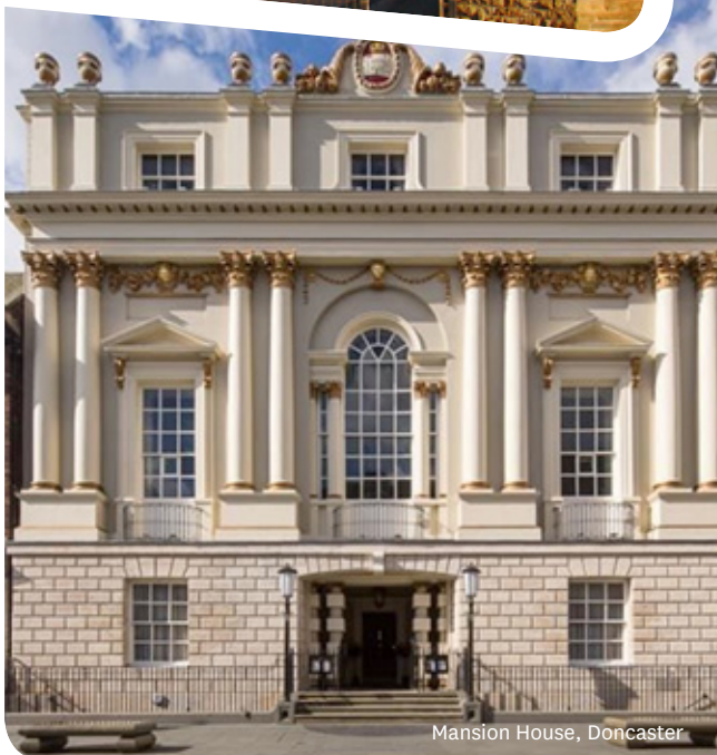
Mansion House, Doncaster

Today Doncaster is a vibrant growing borough that proudly celebrates its past historical connections, no more so than that of William Bradford, one of the most important Mayflower Pilgrims.