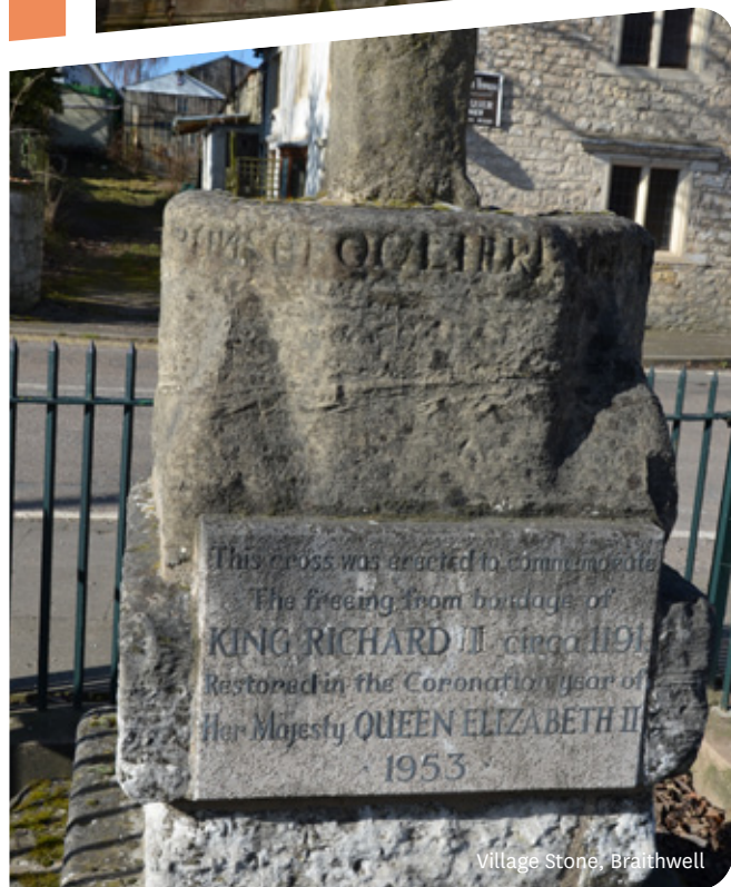
Village Stone, Braithwell